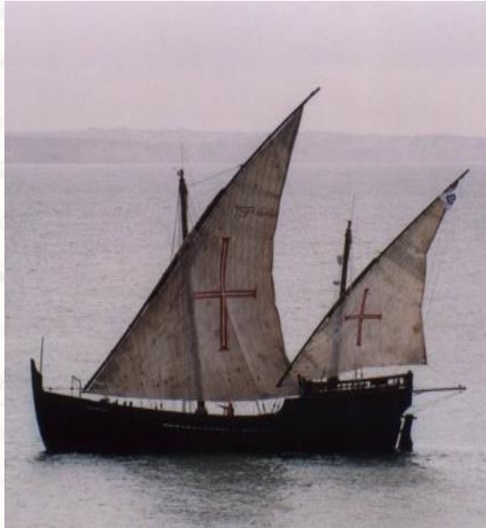
Carabela Boa Esperança