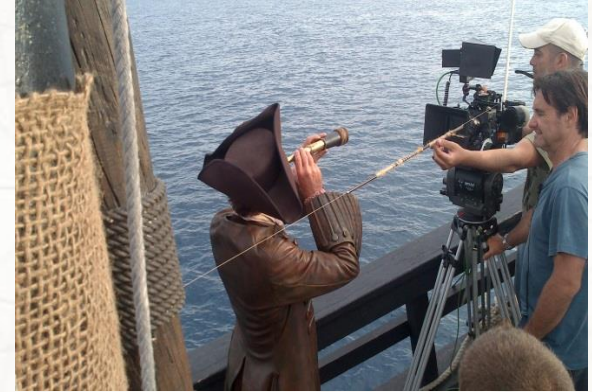
2012. Spot “Gran Barata 2012” of mexican malls LIVERPOOL, “Pirates” , directed by Rodrigo García Saiz for Planta Films. Locations: Costa Brava and Barcelona Port (Spain).